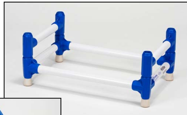
8850 shown above

8860 (raises bath chair height by 15 inches)