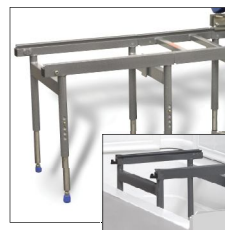
Fits inside tub