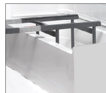
Fits inside tub